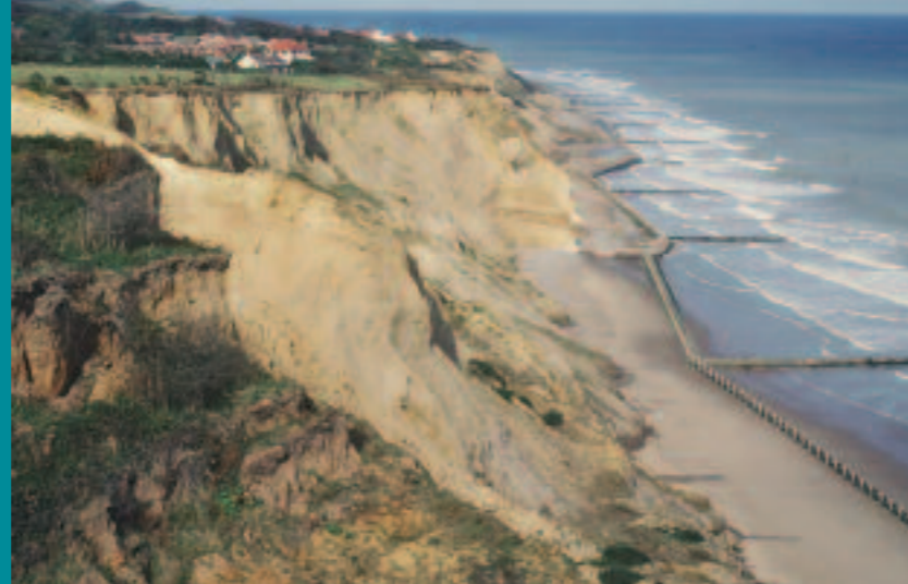
Sidestrans-Trimingham Cliffs, North Norfolk Coast SSSI

The dilemma of allowing our coasts to change in response to rising sea levels is at variance with the public expectation of coastal stability. This is why consultation has been at the heart of coastal management plans in Norfolk. The character of the coast of Norfolk from Sheringham to Great Yarmouth changes from soft, often dramatically high cliffs rich in evidence of the ice age to a low frontage often backed by sand dunes. It is a coast which has been eroding by about one metre a year for probably thousands of years.