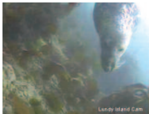
Image from English Nature webcam

You can now get face-to-face with the diverse range of underwater sealife of Lundy Marine Nature Reserve via an underwater webcam on English Nature's website. Live images from the crystal clear waters around the island, which contain some of England's rarest and most spectacular marine plants, are beamed to the website ( www.english-nature.org.uk/webcams ), updating every 30 seconds.