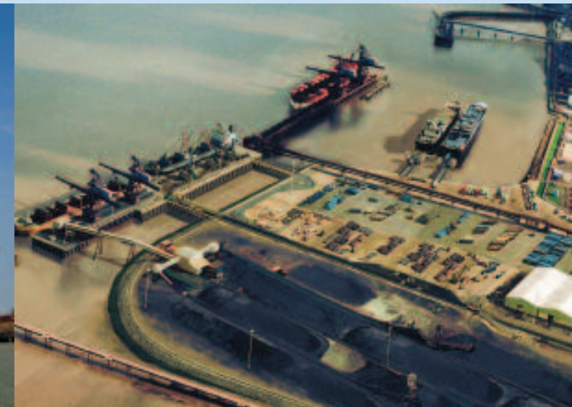
Artists impression of Immingham Outer Harbour