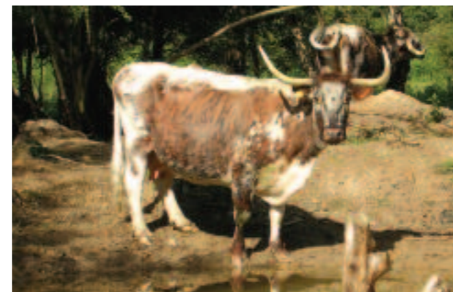
Longhorn cattle at Skipworth Common