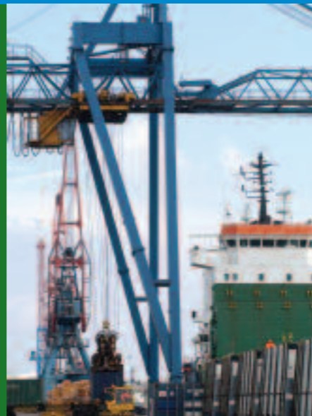
Port activity at Immingham