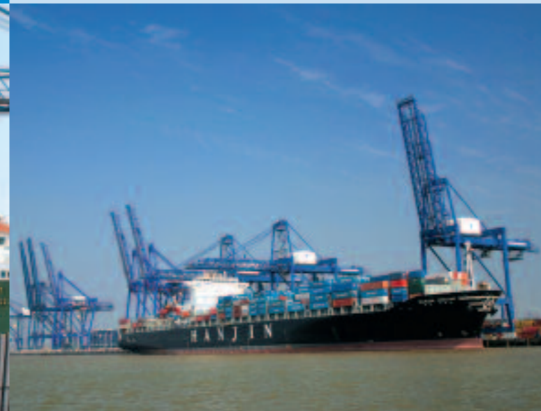
Vessels at Felixstowe