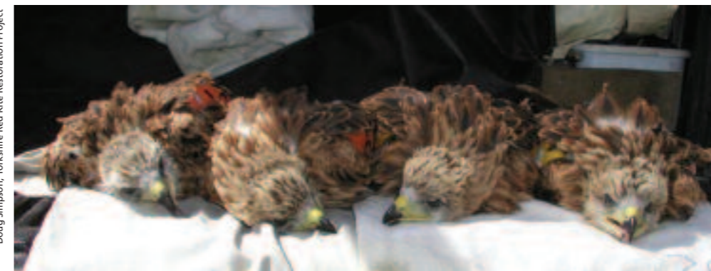
Four of a kind in Yorkshire

brood in Yorkshire since red kites were first re-introduced there in 1999. It is the only known brood of four in England this year. The average brood size is between one and two.