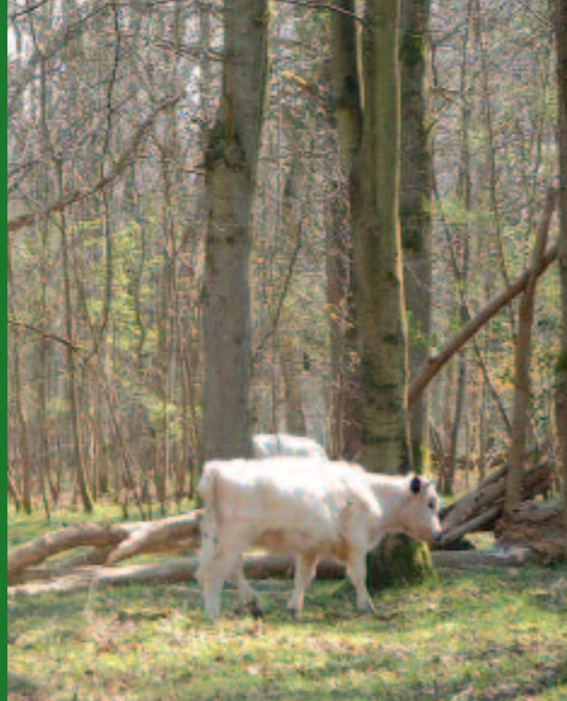
Cattle grazing at Savernake

An innovative project has been set up to help bring together people with grazing stock and the owners of grazing sites in Wiltshire.