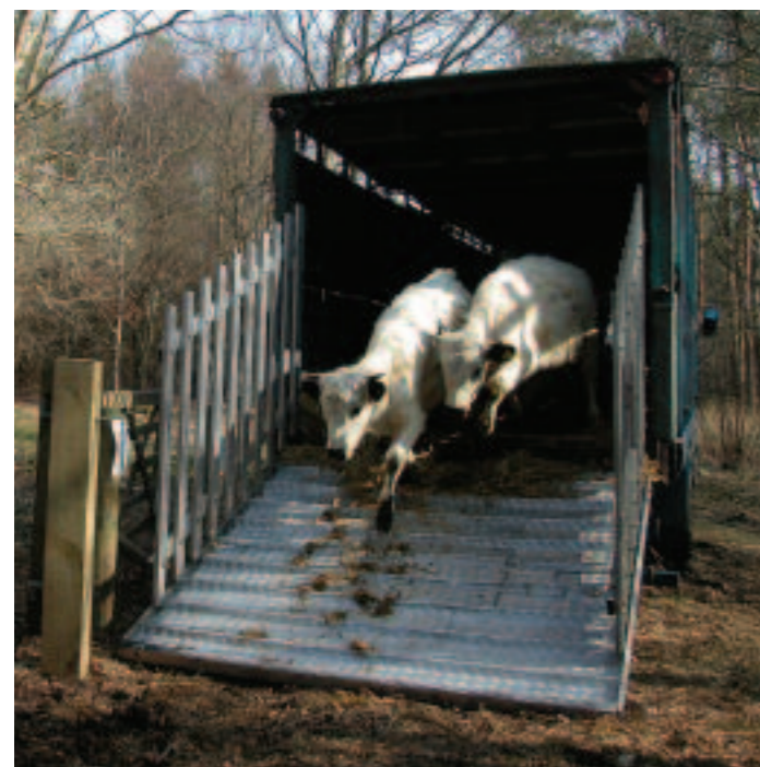
Cattle released to graze as part of WIGI